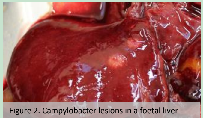
Figure 2. Campylobacter lesions in a foetal liver

intercurrent diseases that impacted on the health of ewes carrying the foetus(es) to term.