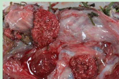
Fig 3. Toxoplasma lesions on aborted sheep placenta.

Many of the common causes of abortion in sheep including Chlamydia abortus , toxoplasma (Figure 3), Campylobacter sp. and Listeria monocytogenes are recognised zoonotic agents. Similarly, Y. pseudotuberculosis should also be regarded as a potential zoonosis.